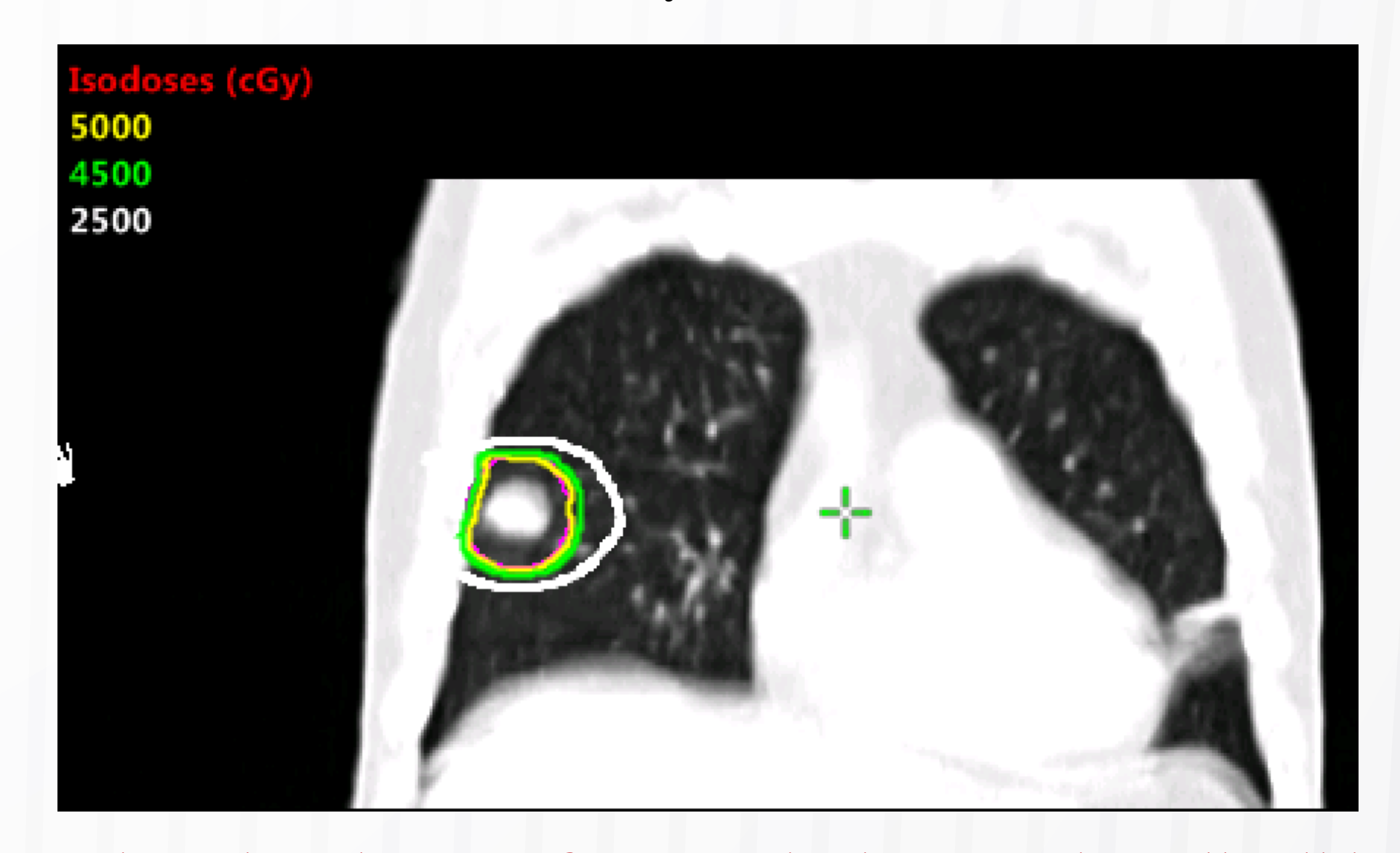
Figure 1: Isodose distributions for a newly diagnosed small cell lung cancer

Complete response was observed in 11/12 (92 %) patients and partial response in 1/12(8%). Toxicity was mild ribs pain and manageable radiation pneumonitis. D1500cc to both lungs resulted lower than 12.0 Gy; D5cc to oesophagus 4.5 ± 3.0Gy; D0.25cc to spinal cord was 10.2 ± 8.2Gy; D15cc to the heart was 10.2 ± 9.7Gy and D1cc to ribs was 15.2 ± 4.5Gy.